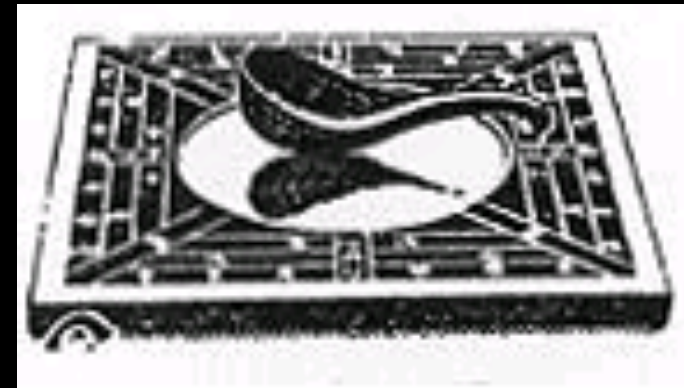
magnetized spoon on plate

Compass needles from magnetized iron: (games, fortune telling) China ~200 BC